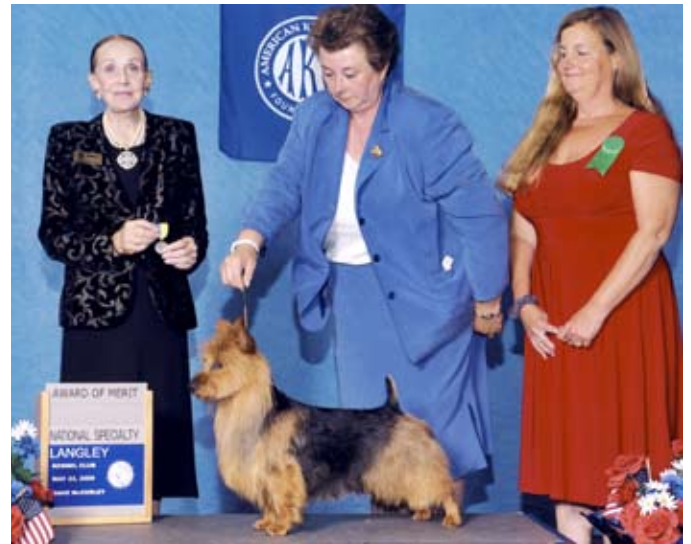
Award of Merit -- Ch Ryba's Call Me Irresponsible