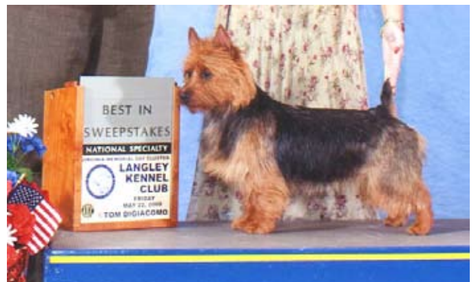
Best in Sweeps -- Temora Where The Magic Begins