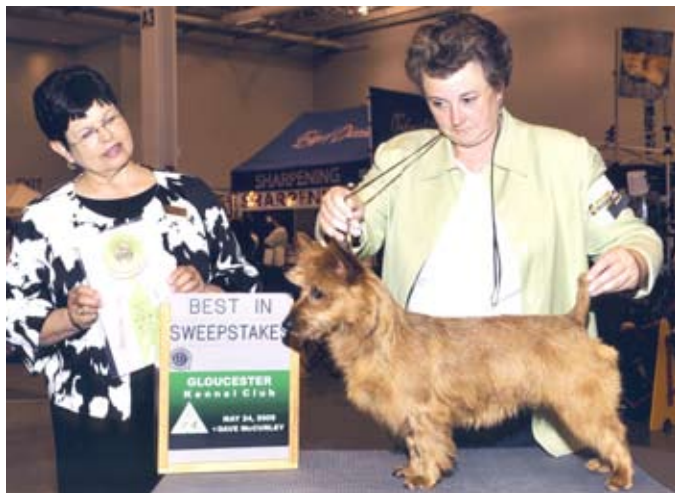
Best in Sweeps (Sun) -- Ryba's On a Clear Day