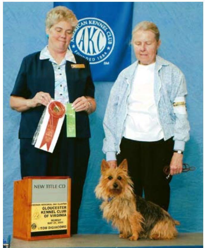
Companion Dog Title -- Ch Ryba's Beat the Odds RE

Completed all qualifying legs during the 3 days of the National weekend also completing her eligibility for the ATCA Versatility Award.