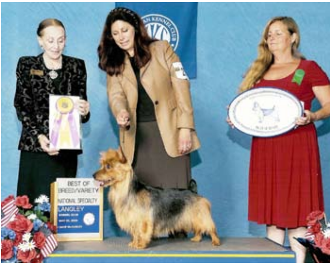
Best of Breed --Ch Benayr I Believe In Love Alfie