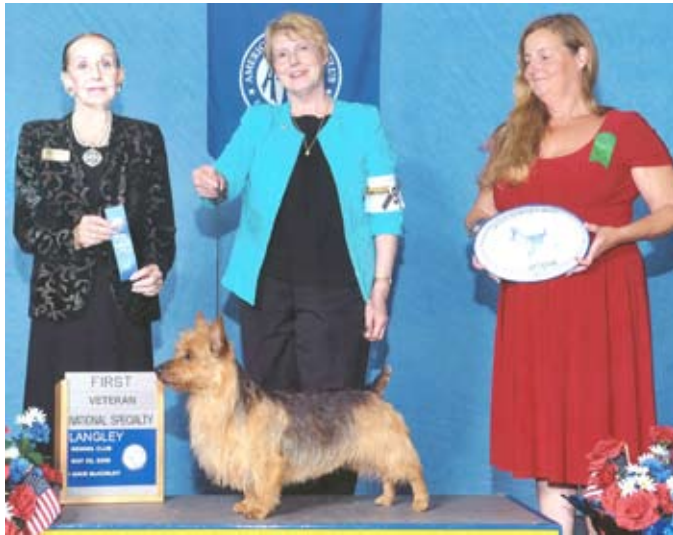
Best in Veteran's Sweeps -- First in Veteran Dog -- Ch Dreamtime's Frontiersman