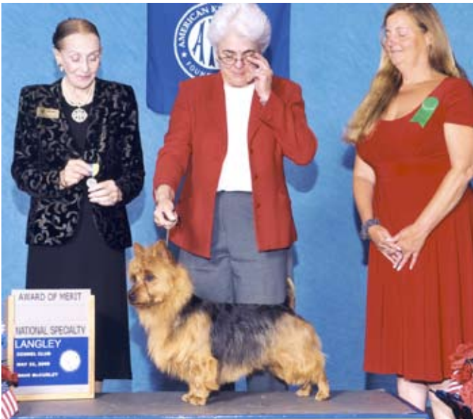
Award of Merit -- Ch Ryba's Matinee Idol