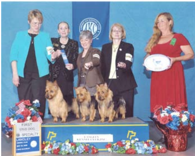
Stud Dog -- Ch Dreamtime's Frontiersman