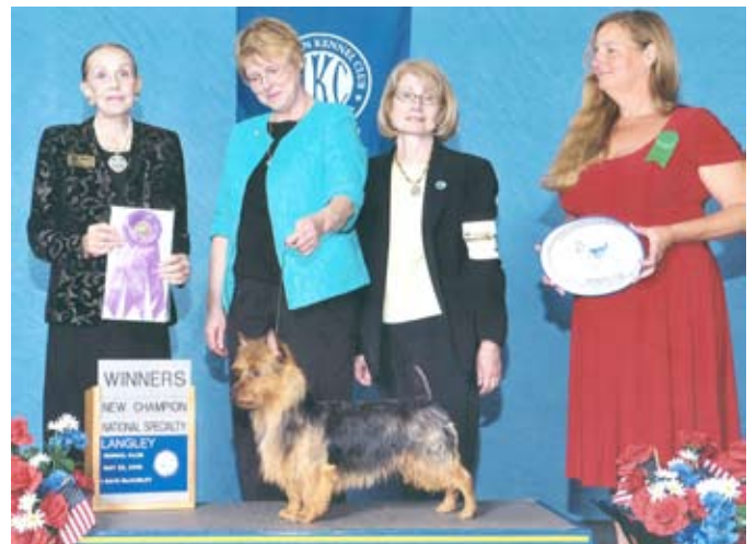
Winner's Dog -- Dreamtime's Latin Lover