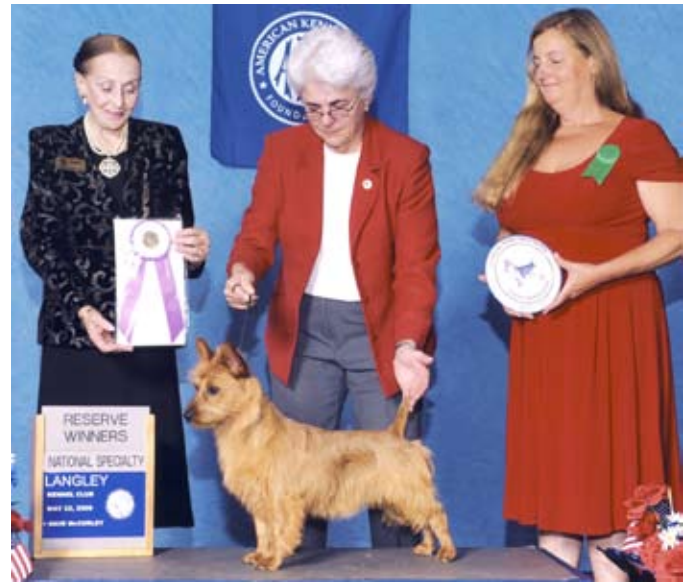
Reserve Winner's Bitch -- Ryba's On a Clear Day